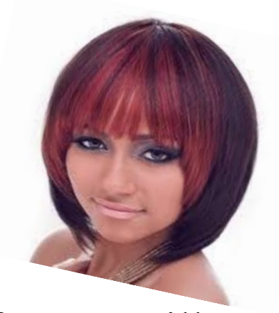
Call or Click Today!